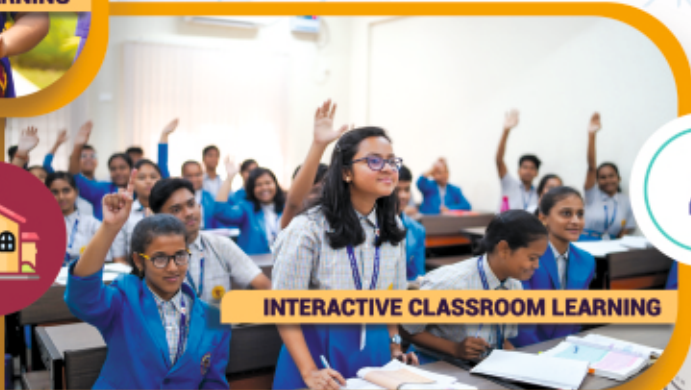
INTERACTIVE CLASSROOM LEARNING