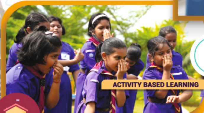
ACTIVITY BASED LEARNING