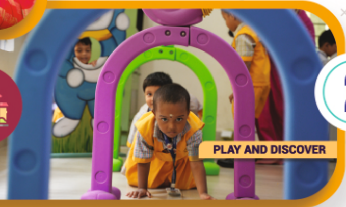
PLAY AND DISCOVER